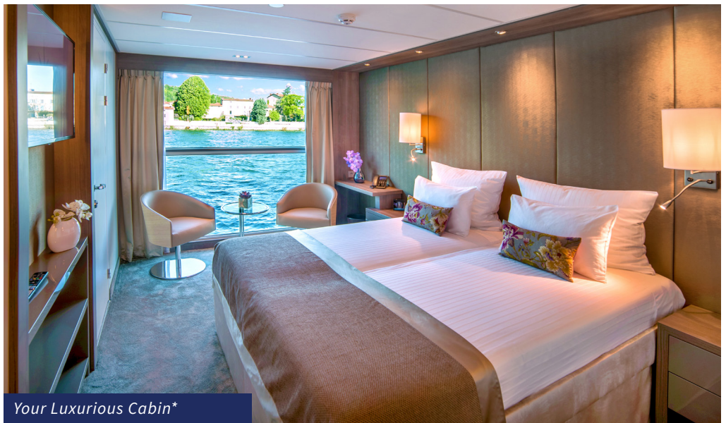
Your Luxurious Cabin*

*Drop down Panoramic windows on Mozart & Strauss decks